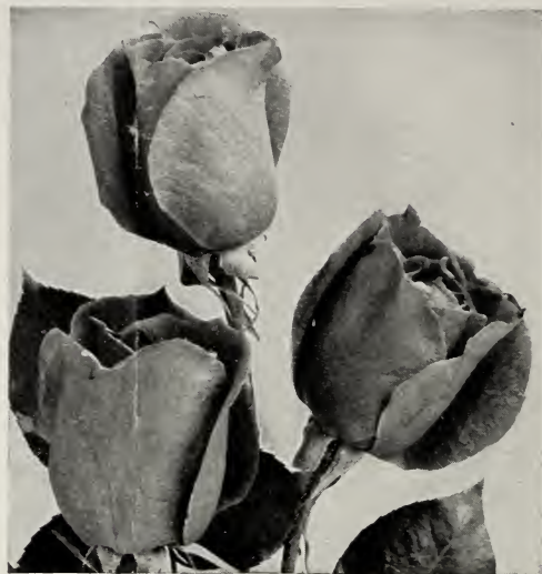
Pride of New Castle

PRICES: "Pride of New Castle"; Strong first size plants 50c each; 5 for $2.00 postpaid. Large two-year-old plants, pot-grown, $1.50 each, 4 for $5.00, $15.00 per dozen by express. If wanted by parcel post add 10c per plant for 2 yr. old. Still larger star size $1.75 each, 3 for $5.00 by express. If wanted by prepaid parcel post add 15c per plant for star size.